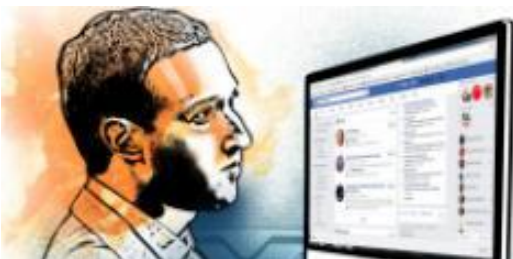
FB's fact-checking initiative in state 14 hrs ago