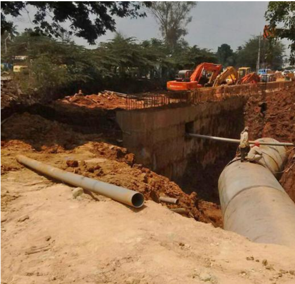
The pipeline being laid in the Varthur lakebed to pump treated water to Kolar.

DH News Service, CREATED: APR 16 2018, 00:57AM IST | UPDATED: APR 16 2018, 08:08AM IST