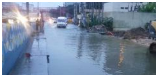
Stay cool: Water-borne diseases unlikely to ruin summer fun 14 hrs ago